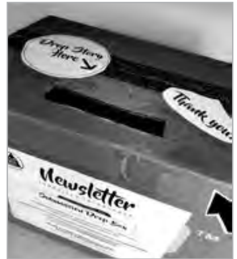
Newsletter Submission Drop Box located at 504 Wilder Ave.